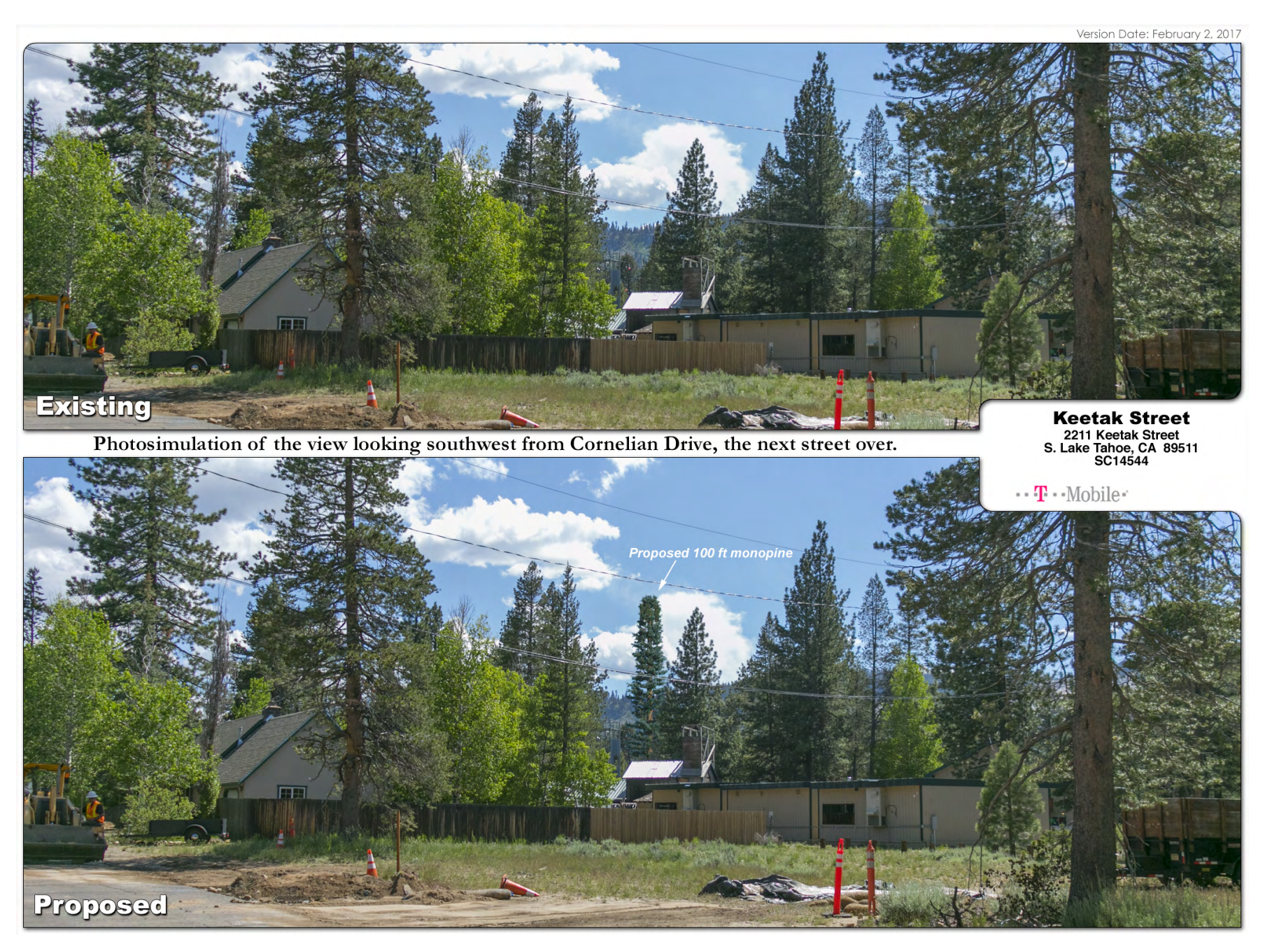
© Copyright 2017 Previsualists Inc. • www.photosim.com • Any modification is strictly prohibited. Printing letter size or larger is permissible. This photosimulation is based upon information provided by the project applicant.