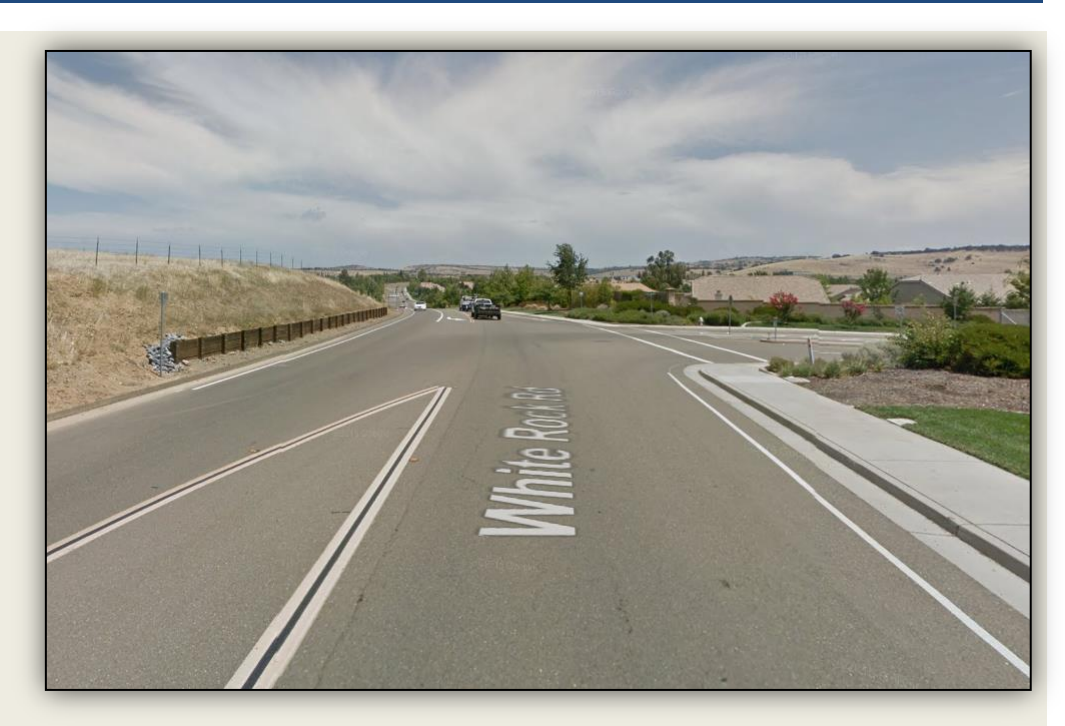
Existing Roadway Looking East at Carson Crossing Road