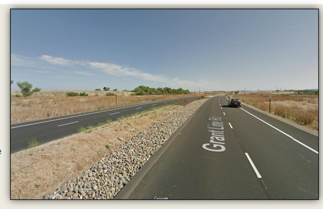
Current 4-lane section west of Prairie City Road in Sacramento County