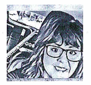
Liz Morris 6 days ago

The money raised barely pays for scholarships, rafting, gas, fees, camping and such.