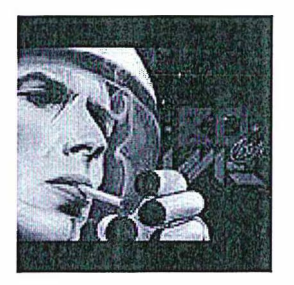
Robb Thurmond 6 days ago

We should always help and promote those who are helping others to experience our wonderful rivers. Especially for those who otherwise couldn't, and who need it the most.