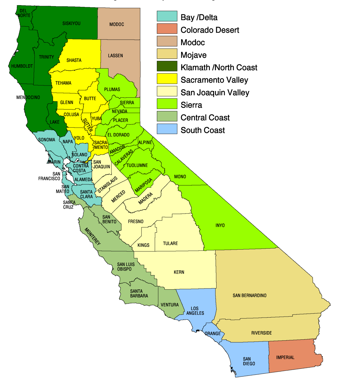
Figure 2. County-based bioregions