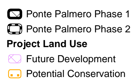
FIGURE 3-2 Project Location Map