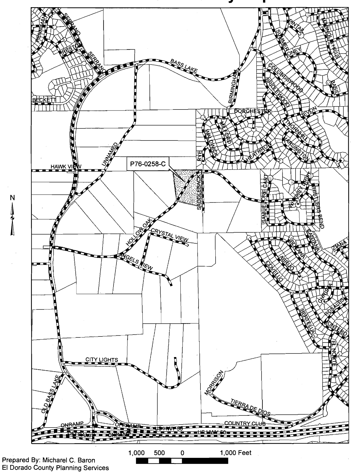
Exhibit A: Vicinity Map