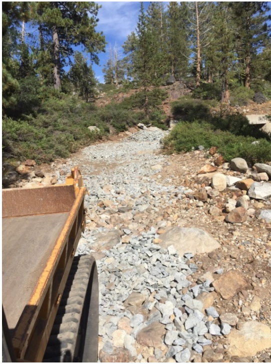
Jarret Creek fill