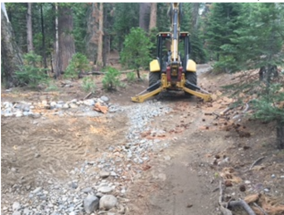
Fill on left water bar middle of picture