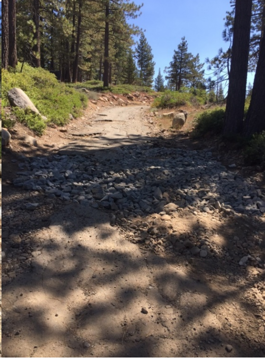
Large holes after Jarret Creek