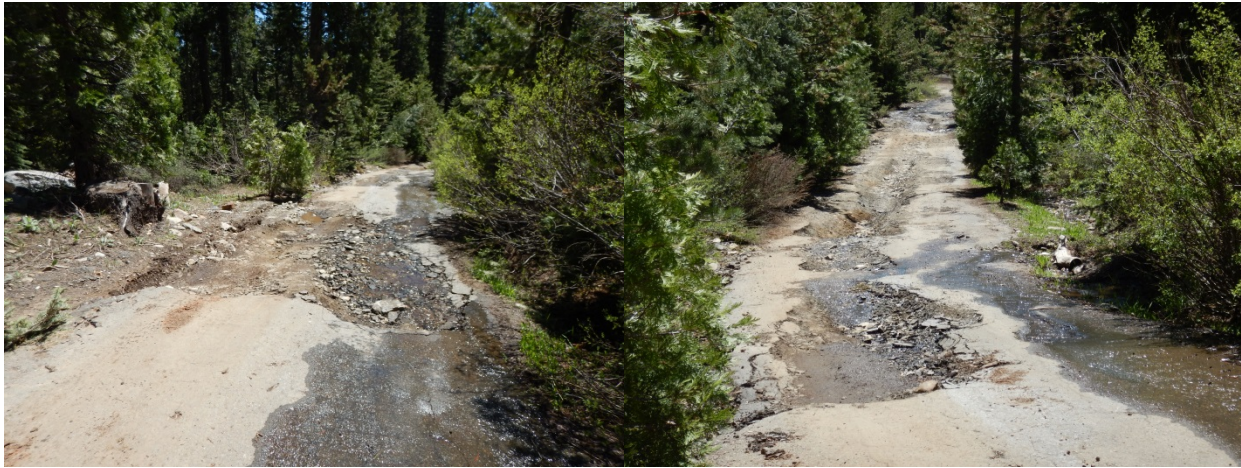
14N07 leading to 14N05