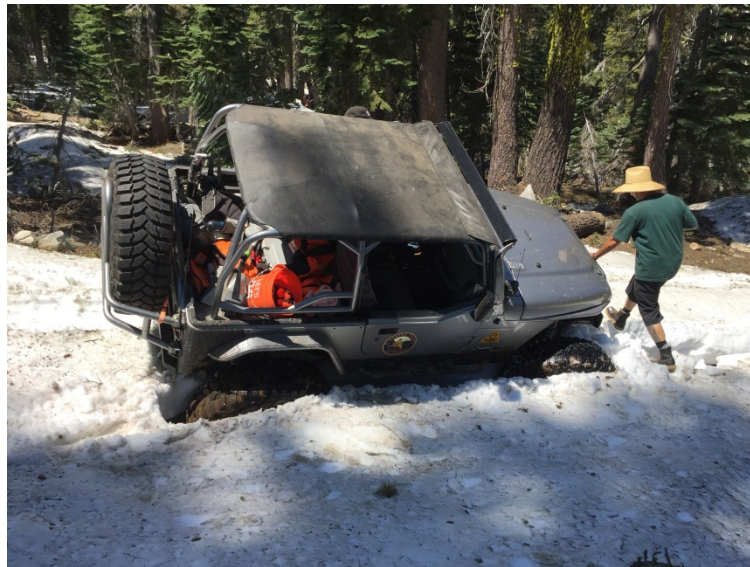
Snow on 14N05 in June.