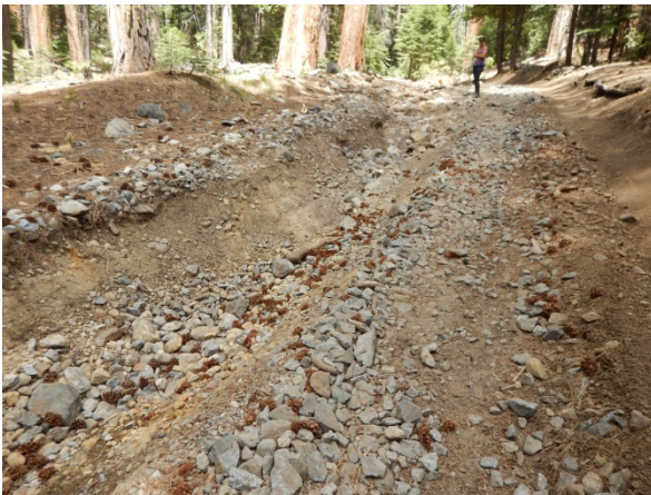
Washout 50'long x 3'wide x 3 feet deep