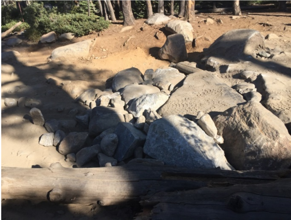
Gatekeeper after repair

Large boulders were added to a hole at the base of gatekeeper which was causing lots of damage to vehicles and spills. A backhoe was used to load the large boulders into a trailer which was then transported to the void and placed using digging bars and a winch to get them where they needed to be. This has created a ramp like effect and reduced the breakage and sedimentation from tires digging holes and spills.