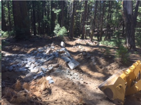
Water Bar increased in size