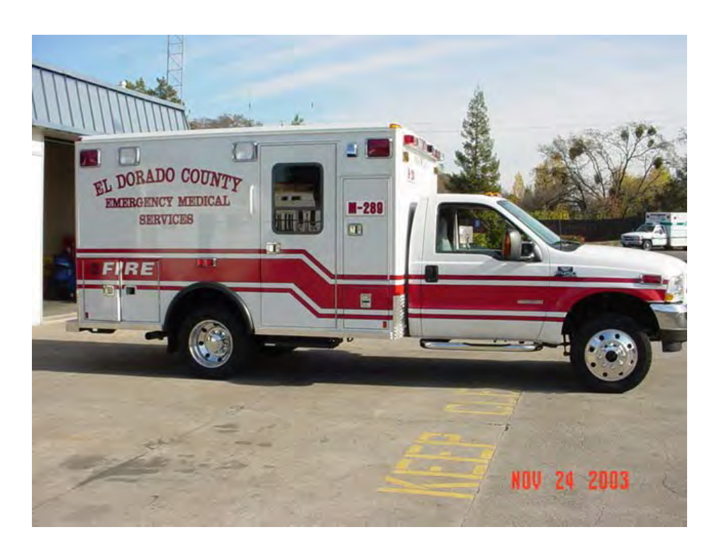
Figure 2 – Passenger Side View