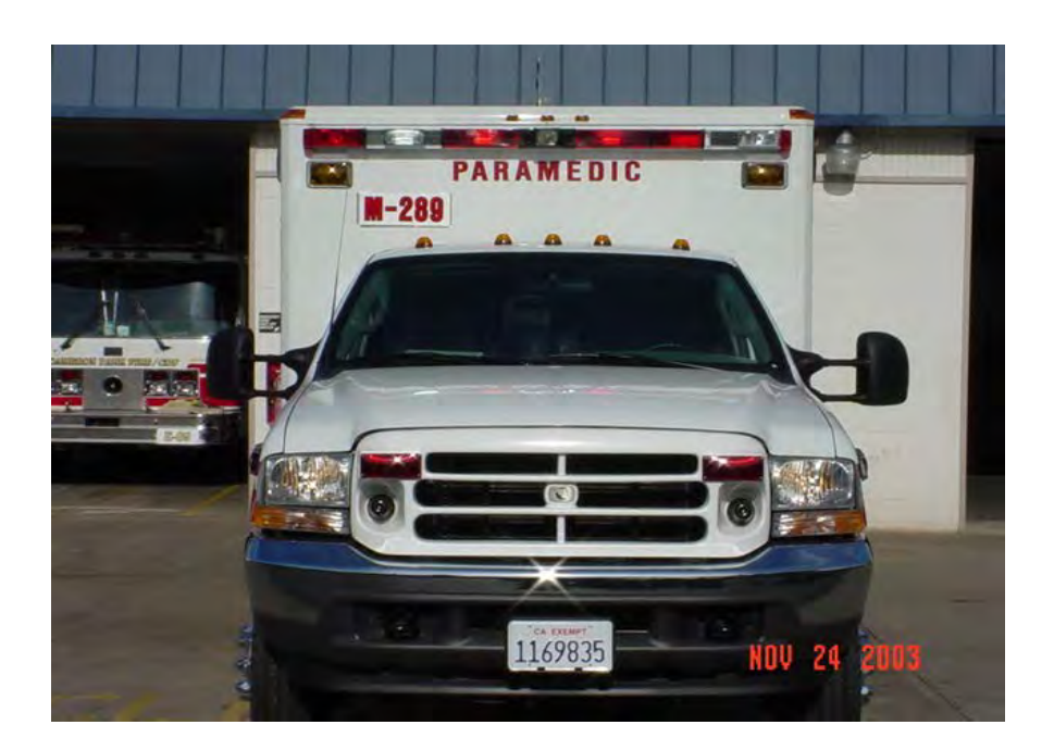
Figure 4 – Front View

The word Paramedic is centered on the on the front of the patient cabin. The top of the letters is 2 1/8 inches from the bottom of the light bar. The letters are 4 inch red reflective with ½ inch pin stripe around each letter.