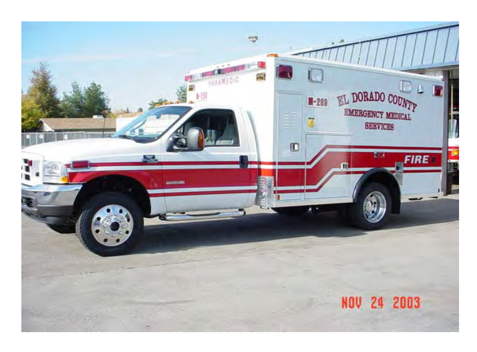
Figure 1 – Driver's Side View