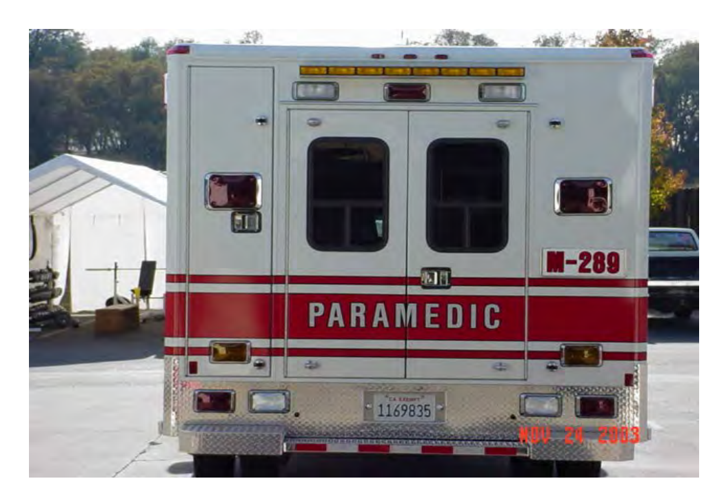
Figure 3 – Rear View

The word Paramedic is centered on the patient cabin. The top of the letters is 2 1/8 inches from the bottom of the light bar. The letters are 4 inch white reflective with ½ inch pin stripe around each letter.