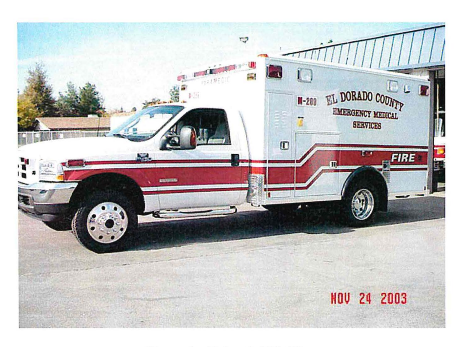
Figure 1 – Driver's Side View