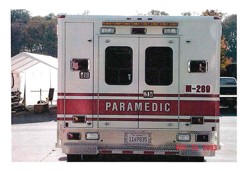
Figure 3 - Rear View

The word Paramedic is centered on the patient cabin. The top of the letters is 2 1/8 inches from the bottom of the light bar. The letters are 4 inch white reflective with ½ inch pin stripe around each letter.