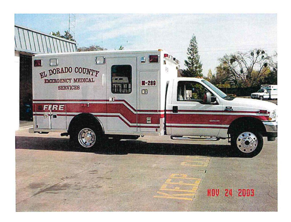
Figure 2 – Passenger Side View