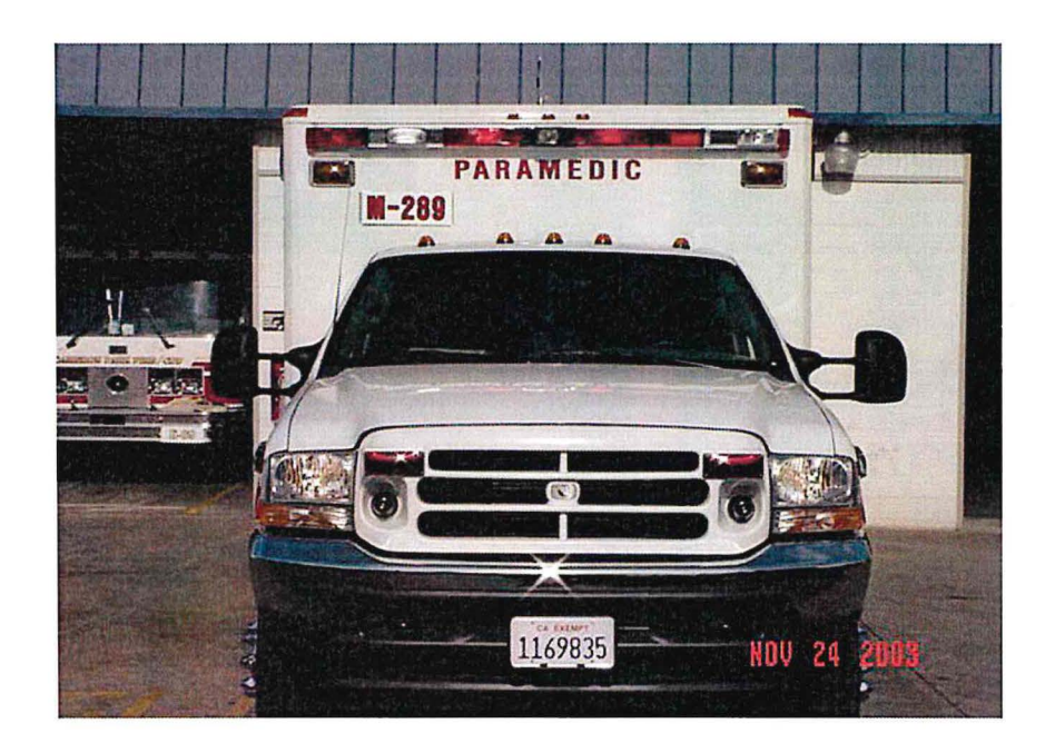
Figure 4 - Front View

The word Paramedic is centered on the on the front of the patient cabin. The top of the letters is 2 1/8 inches from the bottom of the light bar. The letters are 4 inch red reflective with ½ inch pin stripe around each letter.