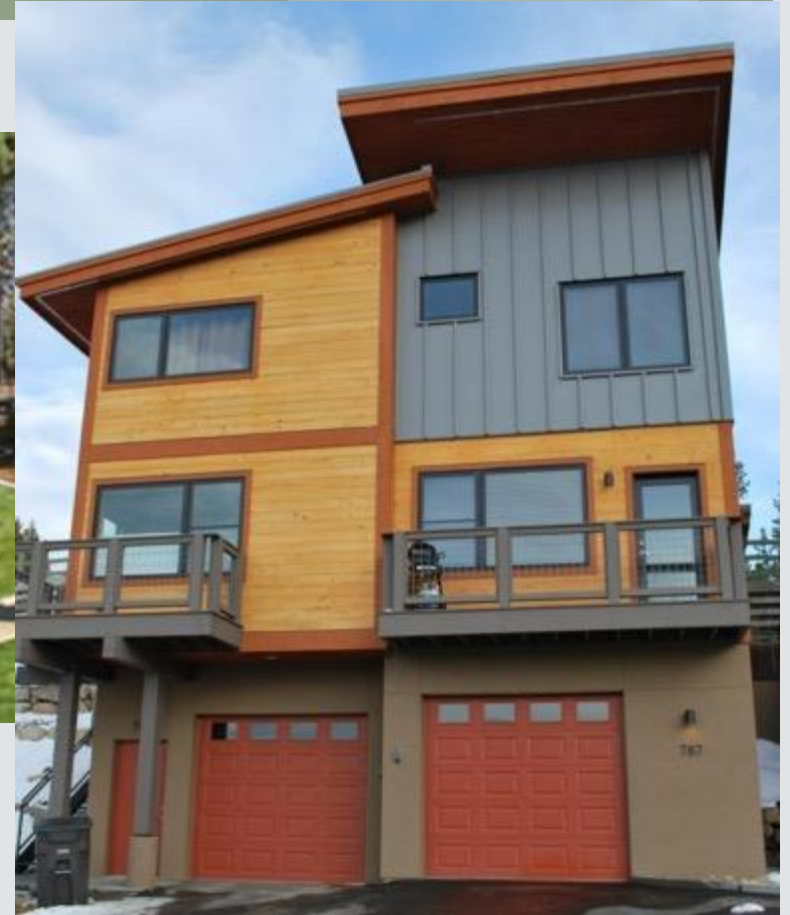
Left to Right: Mammoth, Truckee, Dillon, CO