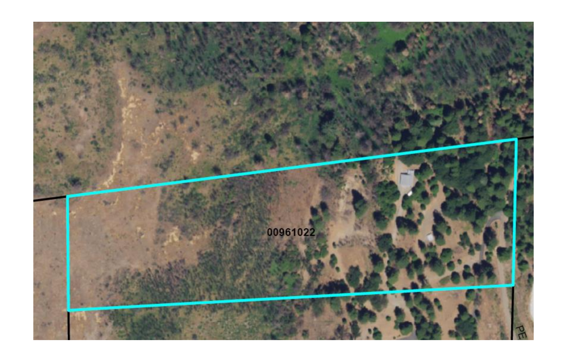
S18-0007/Short Place Applicant: Epic Wireless for AT&T Mobility