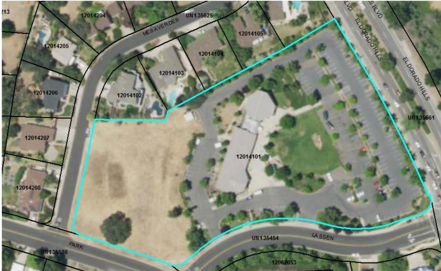
S79-0020-R-2/Vintage Grace Church Addition Applicant: Jarrod Weaver