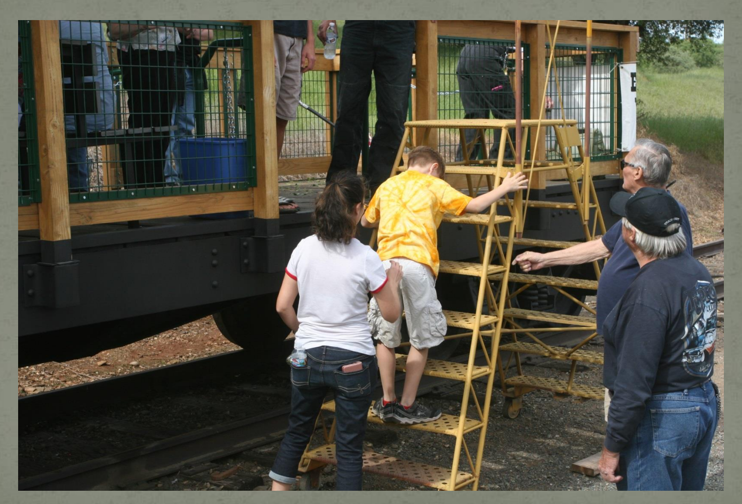
County Museum for Parks & Recreation Commission March 21, 2019