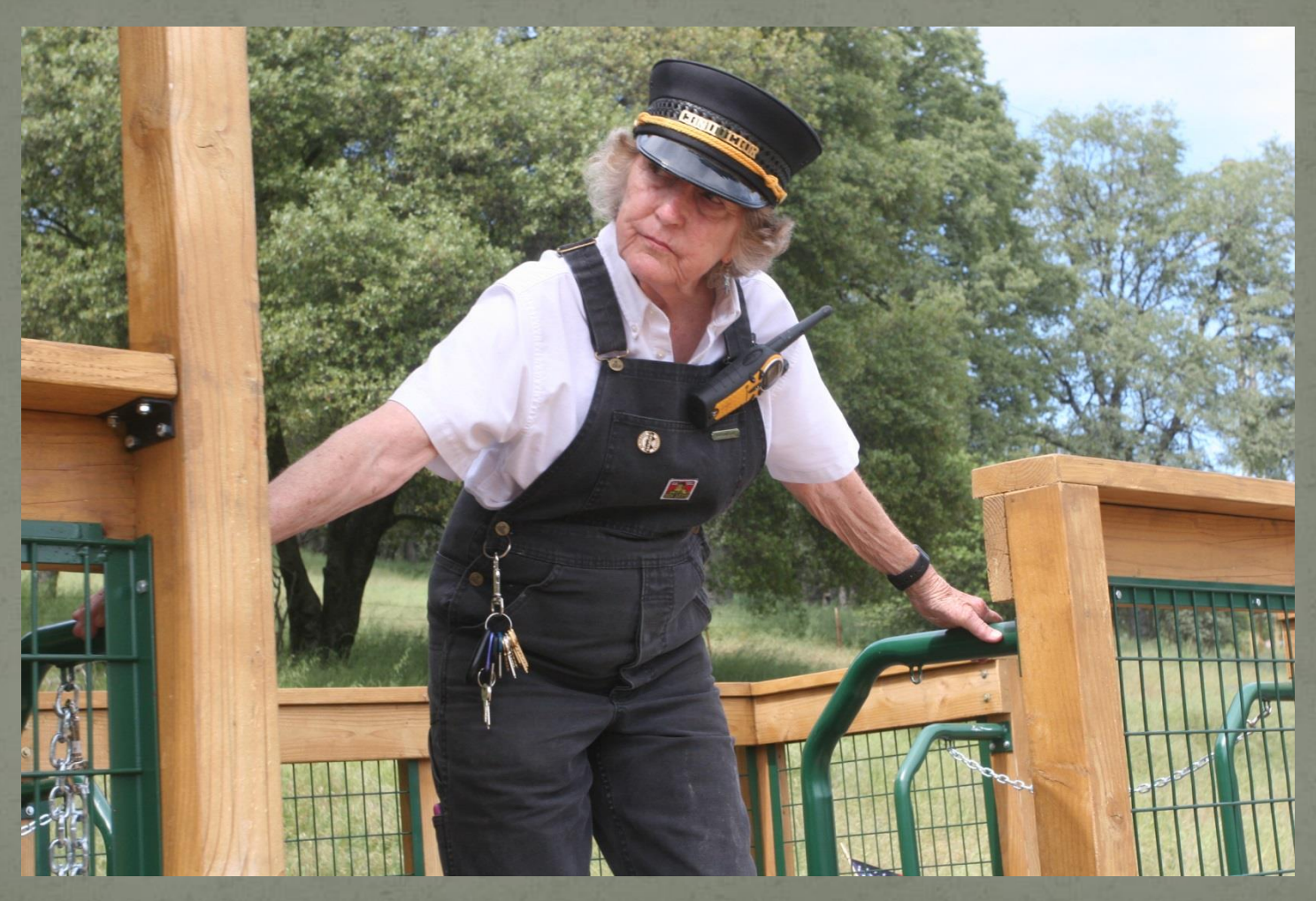
County Museum for Parks & Recreation Commission March 21, 2019