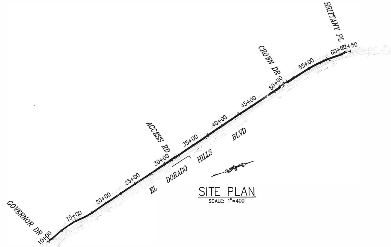
SITE PLAN SCALE: 1"=400'

COUNTY OF EL DORADO DEPARTMENT OF TRANSPORTATION (530) 621-5900 2850 FAIRLANE CT PLACERVILLE, CA 95667