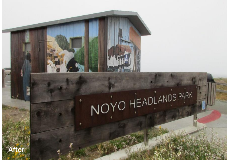
A restroom's exterior is enhanced to tell the community's story. Left: Noyo Headlands Park, before. Right: Noyo Headlands Park, after.