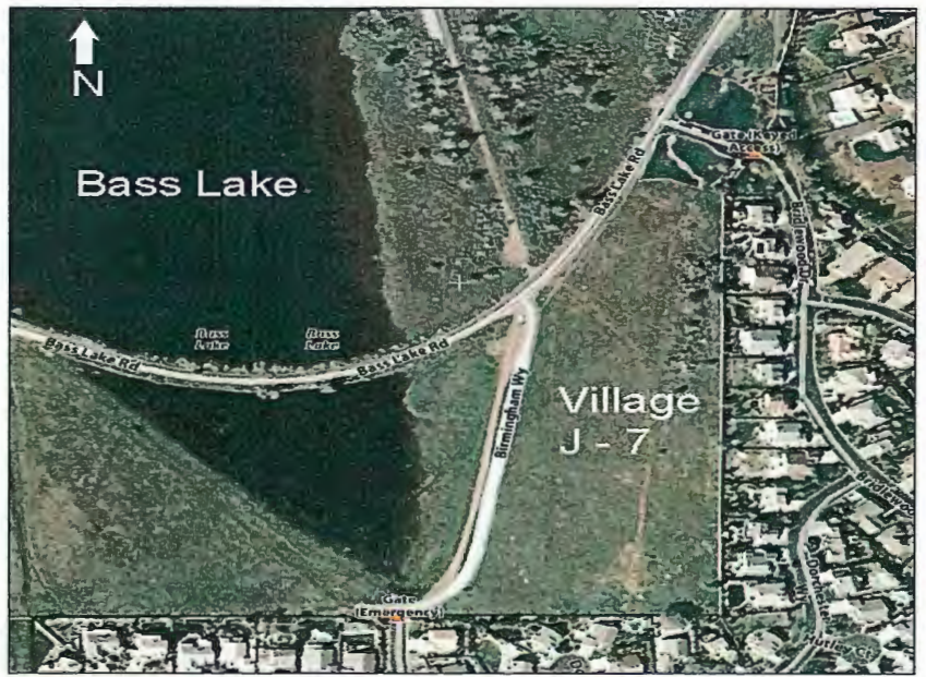
Map showing location of Serrano Village J-7 adjacent to Bridlewood Canyon