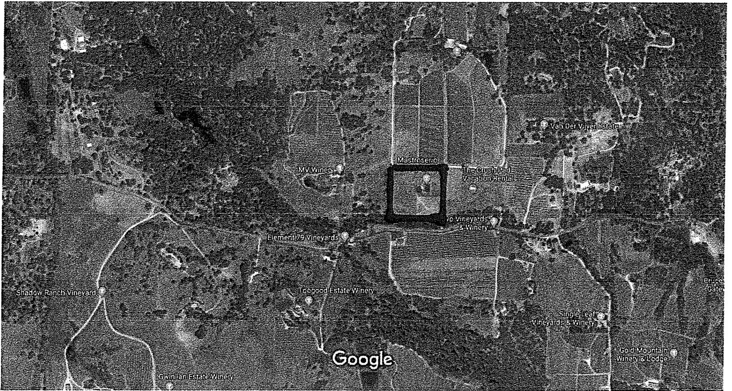
500 ft