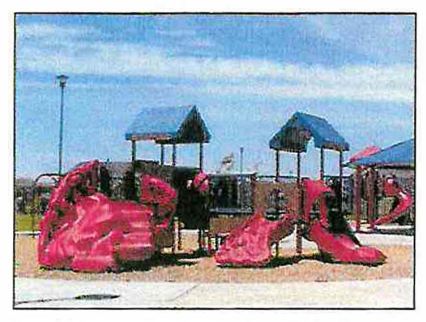
Brightly colored metal and plastic play structures are not recommended.