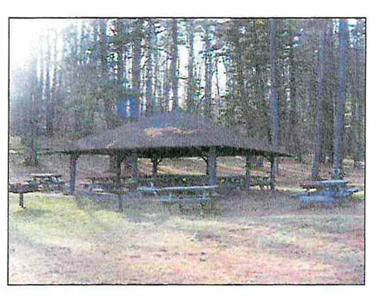
Group picnic shelter.

Picnic areas are typically day use areas and can be designed for one family or large groups. A basic picnic area includes a table, and often a garbage can and grill. Picnic tables may be on a concrete or decomposed granite pad to improve accessibility, but can also be located in a lawn. Picnic tables can be covered with a trellis or solid shade shelter. Grills should not be located under a shelter. Day use picnic areas also require one to two parking spaces per table. Often no fee is charged to use a family-size picnic area, but an entry fee may be collected for entry to the park.