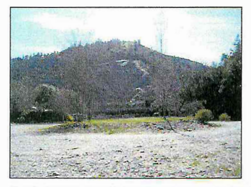
Picnic tables could be installed seasonally on the central mound in the lower parking area.

bars or otherwise controlling drainage down the hillside and trail. Consideration should also be given to replacing the current portable toilets in the upper parking area with a composting or vault toilet. Additional portable toilets may still be needed in the lower parking area during the rafting season.