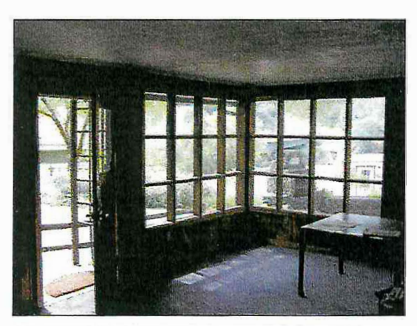
The main floor living room, a potential museum space.

The main floor, with its easy access to the front patio and deck and existing parking, is the area best suited to public access. This would be an ideal site for a museum or information center. One potential partner for the museum is the South Fork American River Watershed Center. The Information Center could also offer maps,