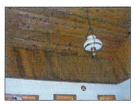
Water damage to the ceiling.

A water leak in the second story bathroom in 2008 led to extensive water damage throughout the second floor and in the ceiling of the ground floor. There is also evidence of water damage on some parts of the second story ceiling, suggesting that the roof may need to be repaired. Although no evidence of mold was present during the site analysis visit, the building should be inspected by a professional to determine what remediation and repair work is necessary. Additionally, the electrical system, roof, foundations, and