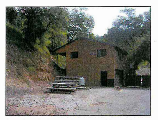
A rooftop deck over storage would provide needed access to the upper level of the house.

All improvements to the house should emphasize energy efficiency and environmental sensitivity with respect to materials and appearance.