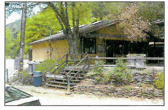
Existing store facility.

The County would like to re-open the store to serve the rafters and users of the upper park area. The concept has been discussed with potential concessionaires, but visitor rates and park occupancy time need to be increased before a store is financially viable. In addition to rafting, camping, and picnicking supplies, the store could also be used to rent life jackets and other river safety devices, or incorporate a photography business, as it has in the past. With the patio and outdoor grill,