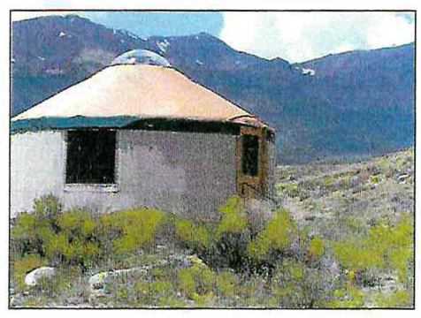
A pre-fabricated yurt.

Often campgrounds have a Camp Host. A person or couple that lives on site, assists campers, oversees maintenance, and ensures that the rules of the campground