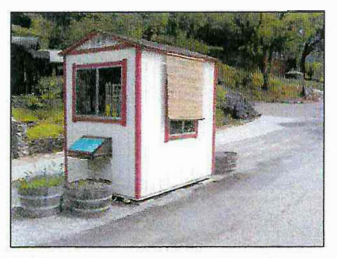
Adding an iron ranger or fee deposit system would allow day use fees to be collected in the off-season.

Since the lower area functions successfully, improvements and changes are expected to be relatively minor. One improvement needed for both the upper and lower areas is an iron ranger or some other method of gathering fees when an attendant is not present. Multiple groups were observed using the site and seemed willing to pay the proper fees if there was a method to do so. Erosion control and soil stabilization is needed on the southern trail from the upper parking lot to the river's edge. There is significant erosion on this pathway, which should be addressed by installing water