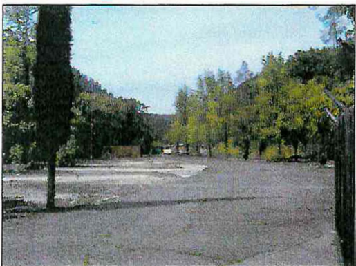
The upper area was formerly a mobile home park.

There is potential on the site for both tent and RV camping. Pre-fabricated cabins or yurts could also be constructed to offer additional camping options. The campground can be designed entirely for small, family groups or also have facilities for group