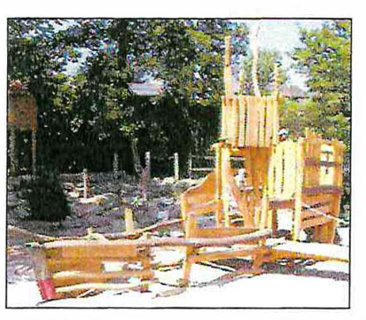
Natural materials create a unique and memorable play area.

Small playgrounds are often found near picnic areas and in campgrounds. To retain the natural feeling of Chili Bar Park, traditional metal and plastic play structures are not recommended. Instead, a play area of natural materials, such as wood, large partially buried pipes, or earthen mounds is recommended. Playgrounds constructed out of irregular natural materials create a much stronger identity and sense of place than standard pre-fabricated structures. A playground does not generate revenue, but may add to the recreational experience for campers and picnickers.