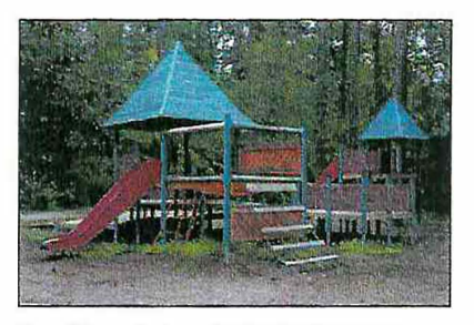
Traditional structures painted to blend with the surroundings are recommended.