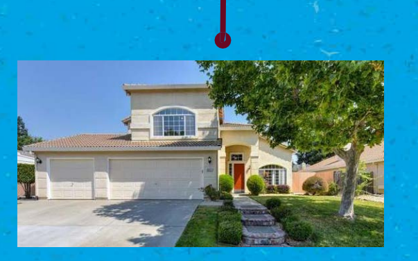
Large-lot single family home