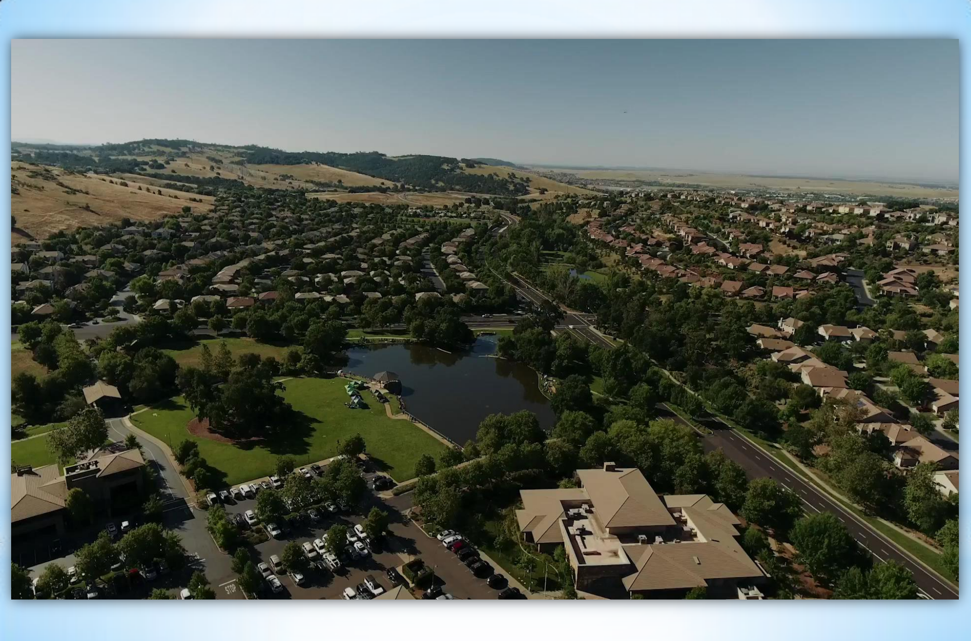
El Dorado County Fish & Wildlife Commission 19-1378 A 18 of 20