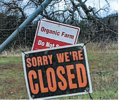
Farm closed for the season.