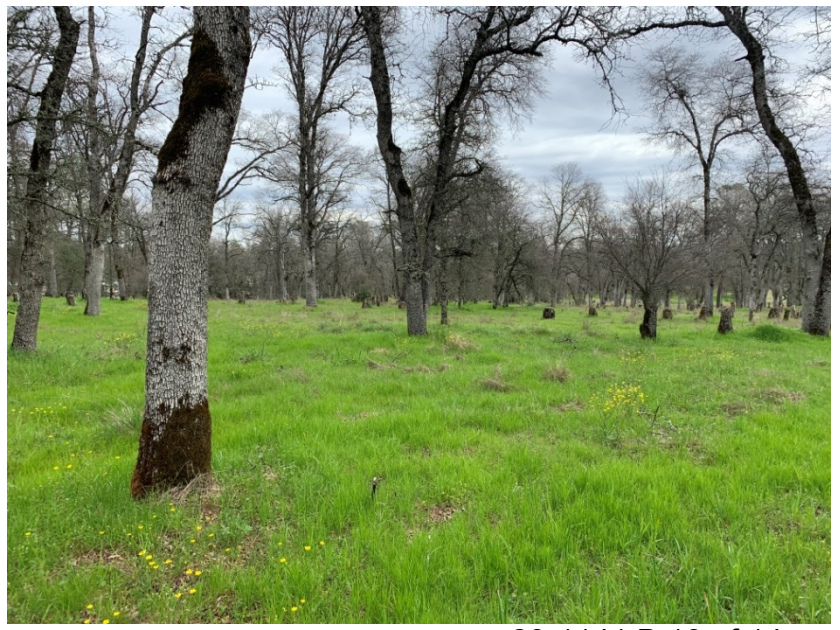
20-1141 B 10 of 14