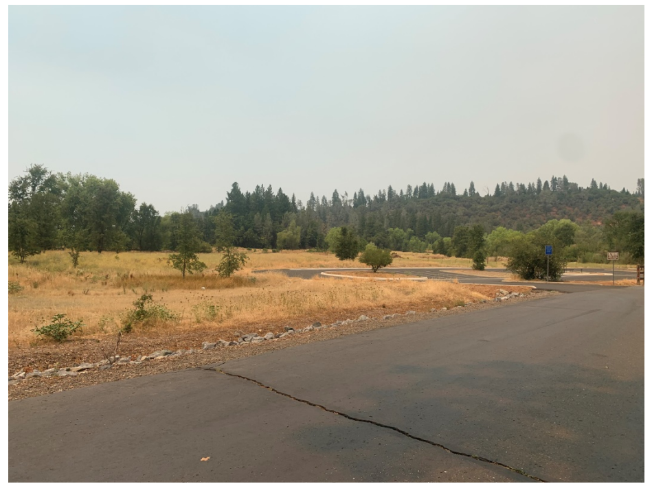
20-1141 B 12 of 14