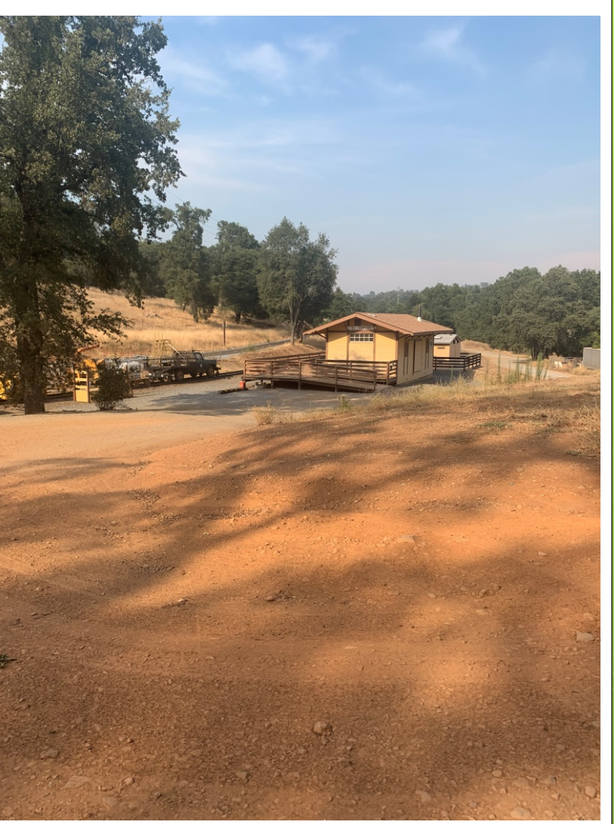
20-1141 B 8 of 14