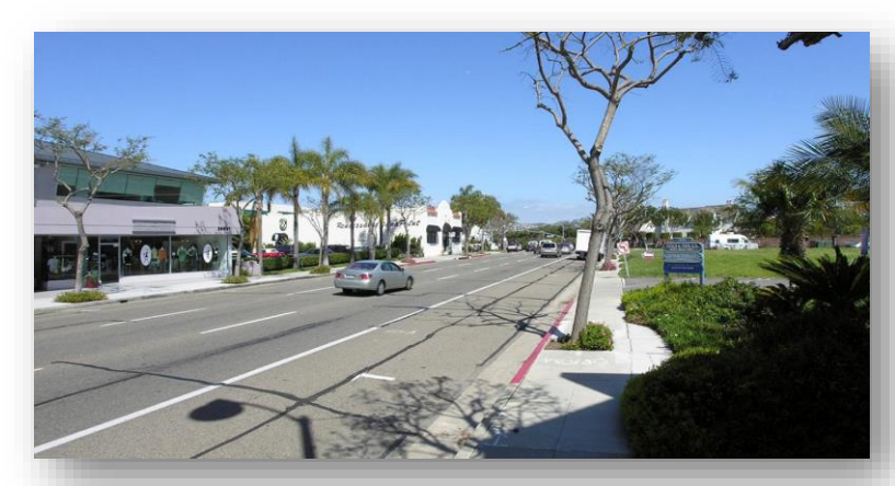
Higher VMT Per Capita