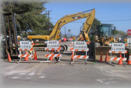
Permits / Inspection