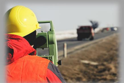
ROW / Survey