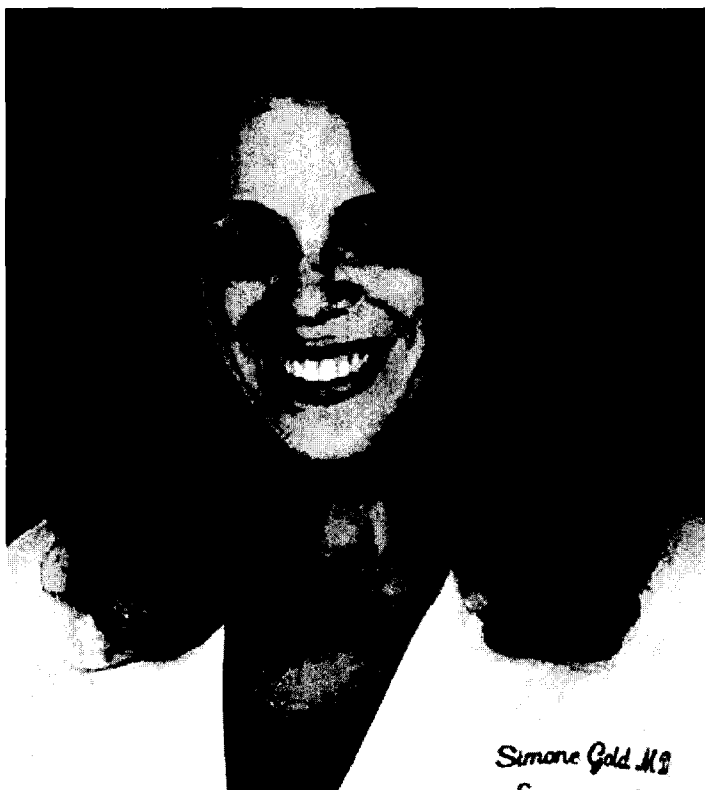
Simone Gold M.D.