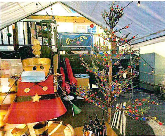
Outdoors @ The Golden Era -