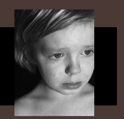
A child in California is abused or neglected every four minutes.

Four children die every day as a result of child abuse and neglect.