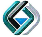
Exhibit B-1 Amended Fee Schedule