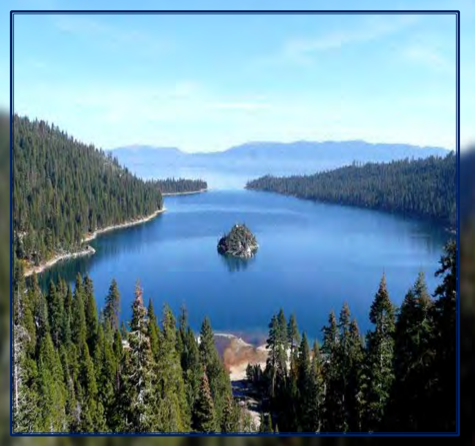
Emerald Bay, Lake Tahoe