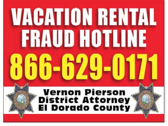
(Close up view of billboard message) 21-1229 A 2 of 11