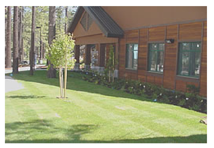
The Challenge program had 22 juvenile participants for the year 2009 with an overall success rate of over 86%.

Mandates under: §881 W&I; Title 15 California Code of Regulations