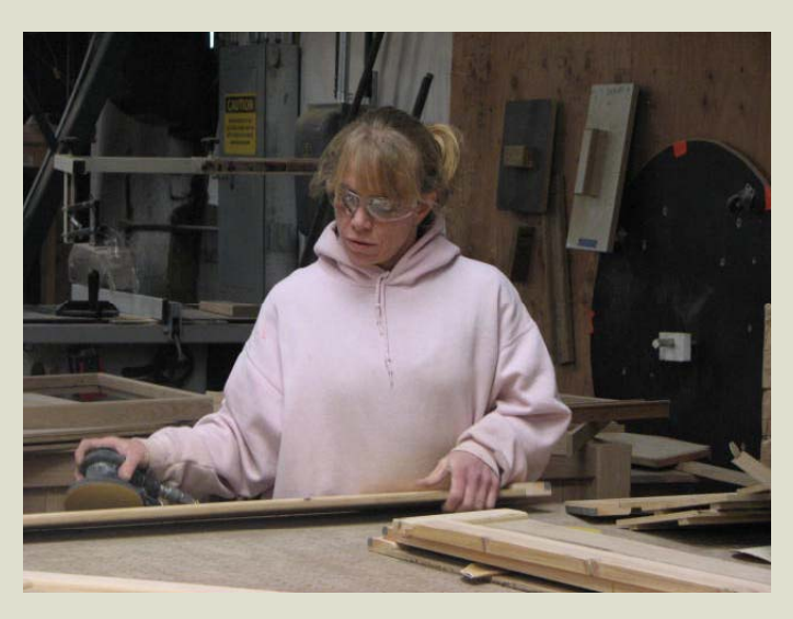
Solid Wood Product: Molding & Flooring