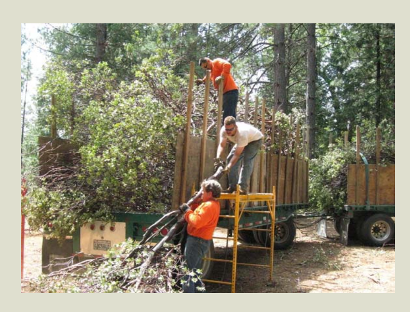
Fuels Treatment: Thinning