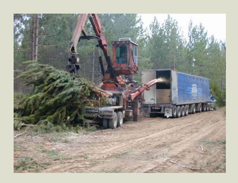
Biomass material transport to facility