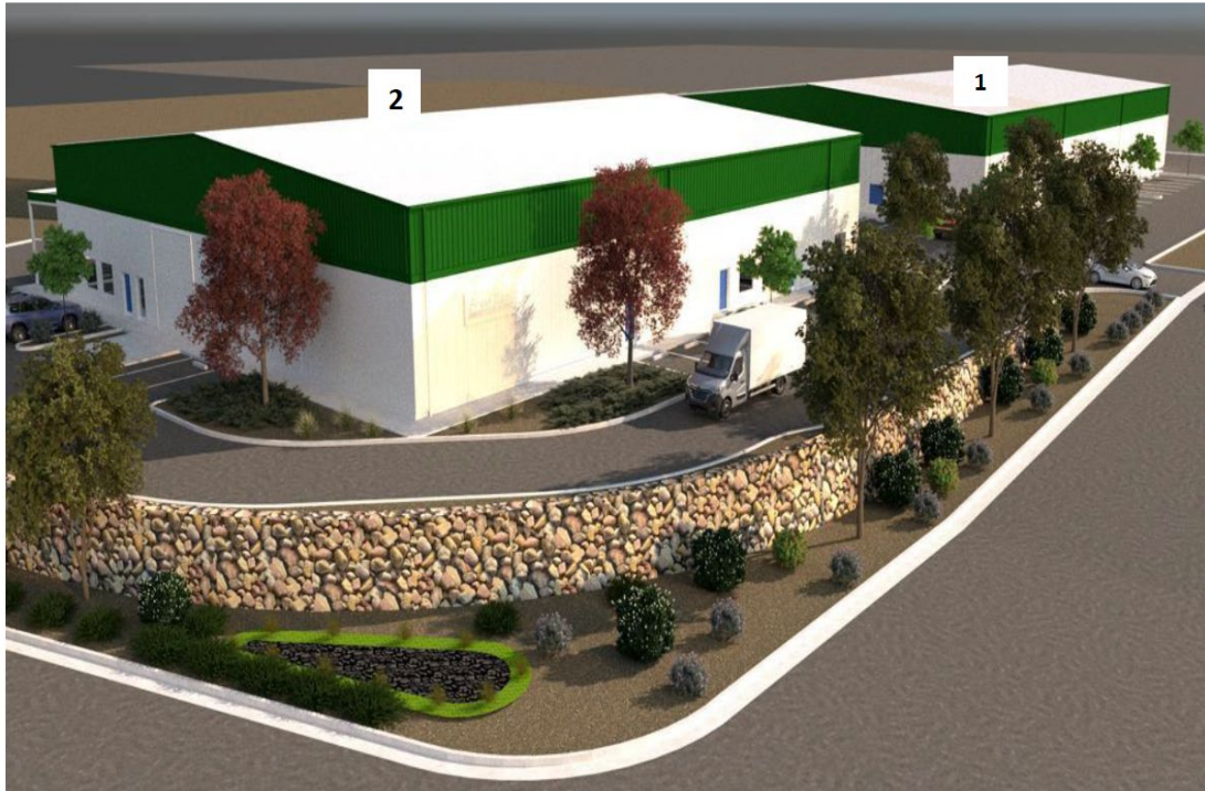
Rendering of Food Bank/Emergency Resource Center Compound Plan: